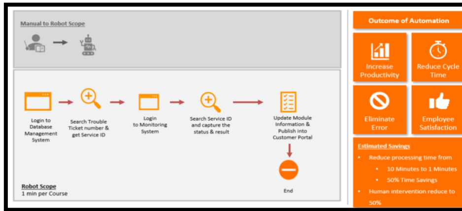
Figure 3. After Automation

Retrieved from (Telecommunication Company Internal Document, 2019), Figure 3 shows the sample of the implementation of the robotic process automation as the proposed first level resolution system in a telecommunication SOC takes over the process, the process only took 1 minute to be completed. The robot scope will be doing the same process as the normal user would do to publish the data in the Customer Portal but with 50% reduced in the time needed usually. This new system will increase the productivity of the workers as they no longer needed to spend more time in getting and publishing the data manually. Subsequently, the workload of the users can be directed to more productive tasks rather than spending time in the systems looking for data. As the process was automated, the chances of errors happening due to manual data handling also will be eliminated. The robot will not likely to return with wrong data if all the parameters passed correctly from the beginning. However, the internal data before and after RPA took place is considered as confidential by this telecommunication company and cannot be published to the public. Thus, the paper only explains in general statement based on the outcome.